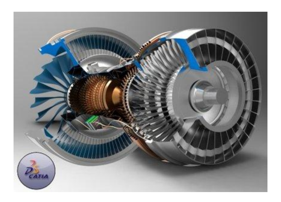
Dassault Systemes CATIA V5-6R2012 SP3 Update (x32/x64) | 864 MB & 953 MB

2:10 am Views: 93 Comments: 0 Catgory: Applications